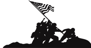
AMERICAN VETERANS OF YUMA

Thanks to our 2024 partners in our mission to support our sea services, veterans and JROTC