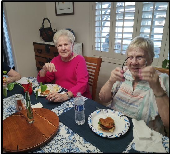
Good Food, Good Company, as members celebrate another successful spring season.

June is time for our traditional Potluck and end our busy spring season with friendly banter and sharing sea stories.